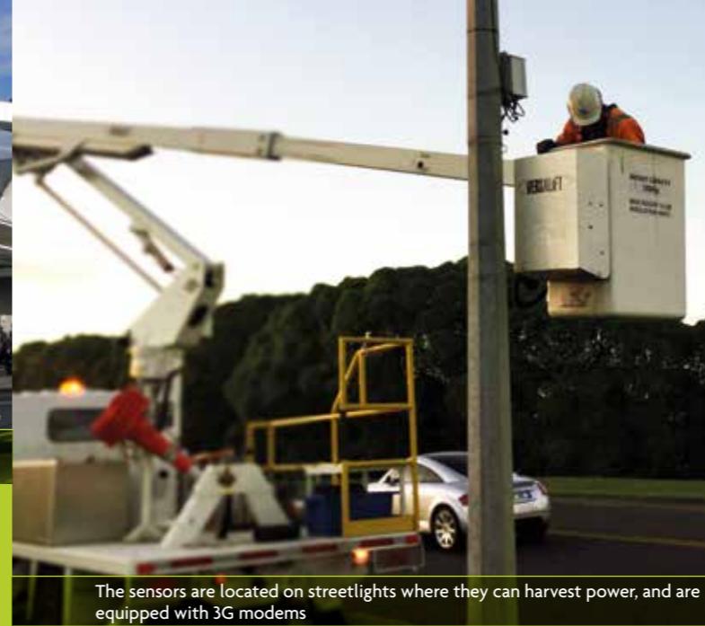
The sensors are located on streetlights where they can harvest power, and are equipped with 3G modems

Whilst traditional highway engineers focus on level of service, occupancy, free flow